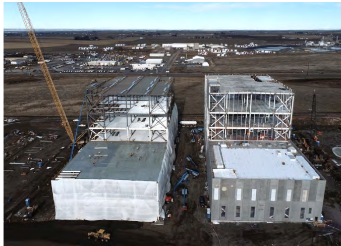
Group 14's Moses Lake incoming plant BAM-2, pictured, began installing equipment in its first module, according to a Dec. 18 statement from Group 14.