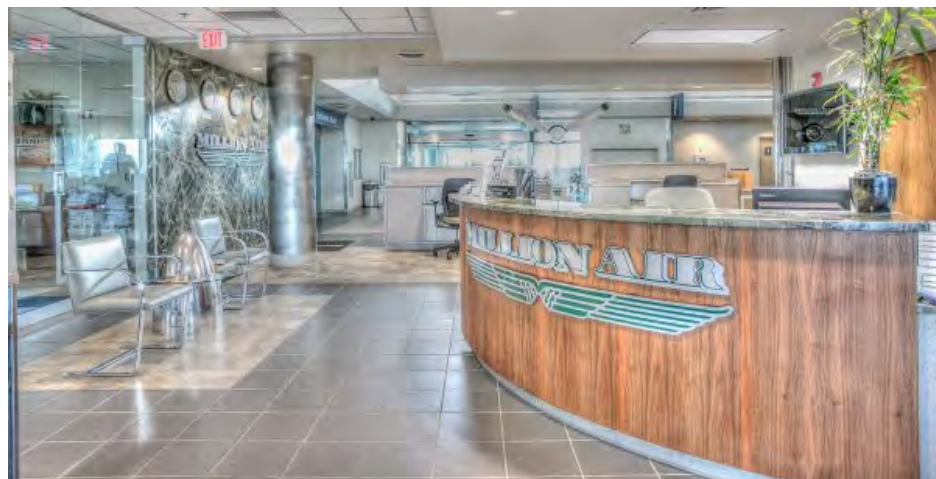
Million Air, at Grant County International Airport

One of Million Air’s earliest goals was to provide a Five-Star service experience to corporate aircraft traveling into a smaller airport terminal. Recognizing a potential in partnering with other small-airport communities, Million Air