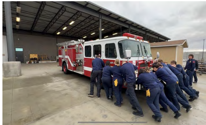
Columbia Basin Technical Skills Center fire science students follow a fire service tradition and push their fire engine into its new home.